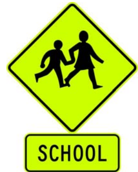
Figure 2: Standard school warning sign

Active school warning signs should be installed in place of the standard sign where additional awareness of children is considered necessary in and around schools in areas and sites meeting the criteria set out in figure 1