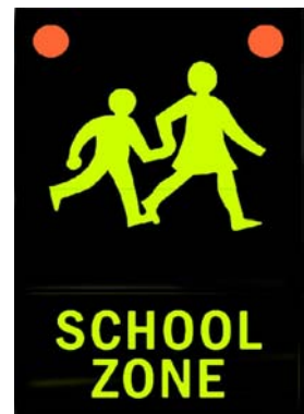
Figure 3: Active – flashing light school warning sign

The 'children' symbol and the words 'school zone' depicted in figure 3 are reflectorised, fluorescent yellow-green in colour while the sign has a plain black, unlit background. There are two orange flashing lights located on the top of the sign at each side which light alternately when in use. Outside school hours the board shows the 'children' symbol and the words 'school zone'.