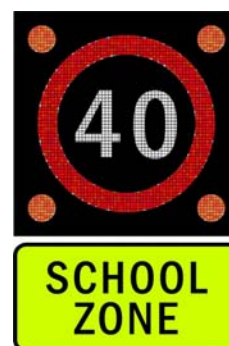
Figure 5: Variable 40km/h speed limit sign

If active school warning signs are proposed near other variable message signs (such as 40km/h variable speed limit signs depicted in figure 5) a careful evaluation of all relevant factors (and options) needs to be undertaken. This is important to avoid the signs' messages being confused or their effectiveness being compromised.