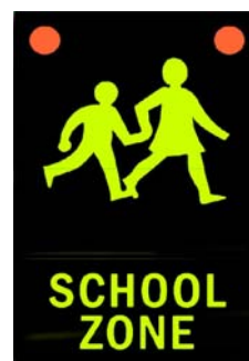
Figure A1: Active – flashing light

Text: 'SCHOOL ZONE' 100mm high/14mm stroke width retroreflective, fluorescent yellow-green