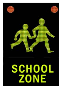
Figure A2 Active - LED

Note: This is the minimum size as specified in the Gazette notice. Larger sizes may be used, particularly where the speed limit is above 50km/h or there is a wide or divided carriageway.