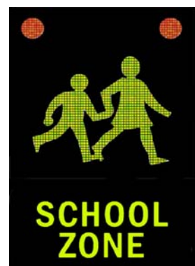
Figure 4: Active – LED school warning sign

When activated, the 'children' symbol and the words 'school zone' depicted in figure 4 are displayed using light emitting diodes (LEDs) on a black unlit background. Two orange flashing lights (which may be LED) are located in the top left and right corner of the sign. When the sign is activated the two lights are not illuminated unless the RCA has set an appropriate condition which would trigger them to be illuminated. This condition could be that an approaching vehicle is detected (by a radar unit mounted in or beside the sign) exceeding a pre-set speed. The orange lights will then flash alternately for a short period until the vehicle has passed the sign. Such a pre-set speed will depend on the speed limit and the circumstances relating to a particular school.