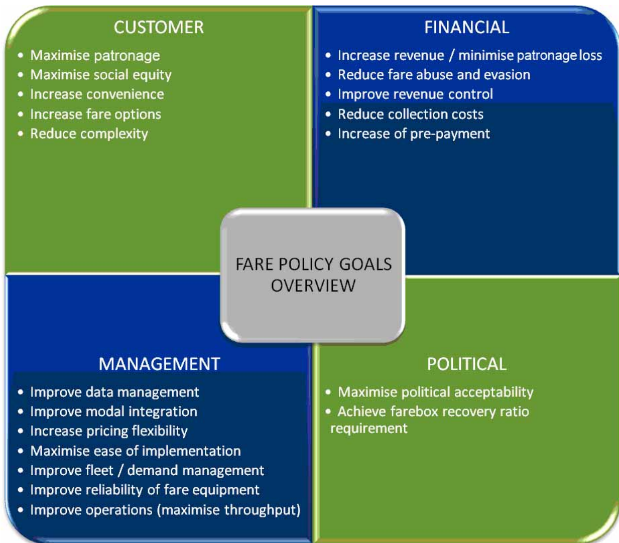
Figure 2: Fare policy goals framework

Figure 2 categorises fare policy goals into four key areas: customer, financial, management and political. By separating goals into these categories, decision-makers are able to conceptualise and think about the various dimensions and prioritise goals accordingly. This model will also be applied in Phases 2 and 5 when evaluating fare systems and structures, and matching evaluation criteria against fare policy goals (as demonstrated later in this guide).