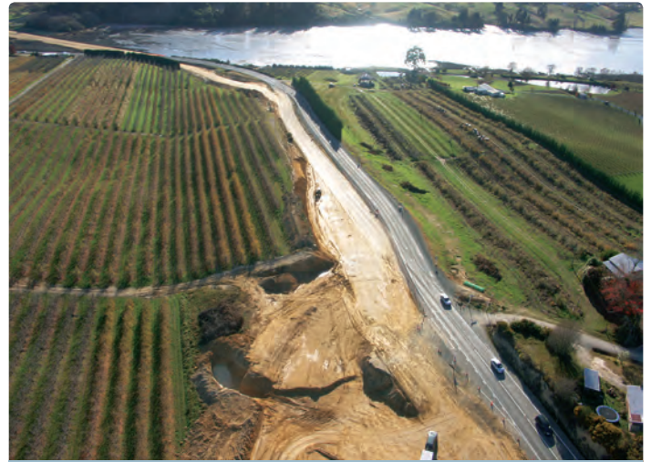
Work is now progressing adjacent to "live" traffic between Dominion and Apple Valley roads.