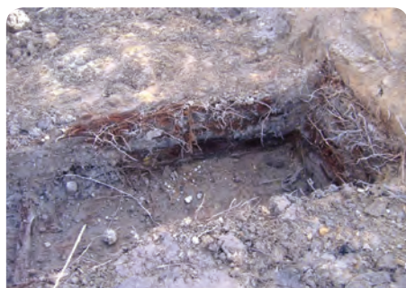
The excavations continued inch by inch

The estuarine areas at either end of the $30m roading project have the potential to reveal material of historical and cultural significance, so an Iwi monitor is present during all excavations in these areas and an on-call Project Archaeologist also monitors work in sensitive areas. This ensures that all cultural and historical finds are respected, investigated and preserved whenever possible.