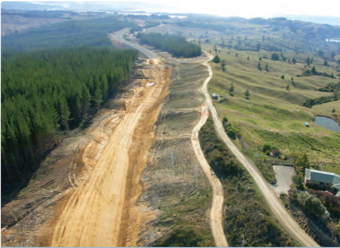
The new highway formation is taking shape and the first layer(s) of aggregate for the new road surface are visible on the alignment as it stretches towards Tasman Bay.