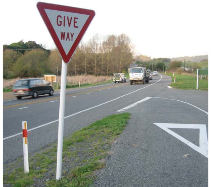
SH1 south of Levin